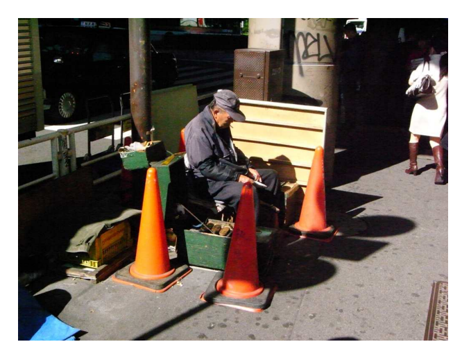
Figure 6 One group's observation of the affordance in people's appropriation of space