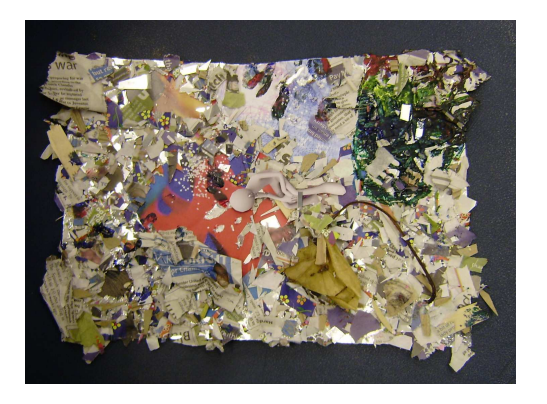
Figure 2 A student's presentation of the Texture of London surface with fragments of newspapers, mirrors and a figure of herself