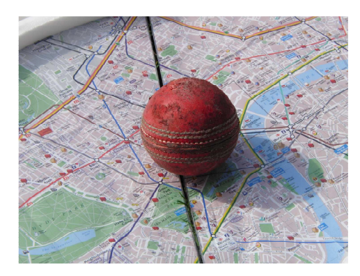
Figure 3 A student's presentation of the Texture of London by creating traces on a cricket ball