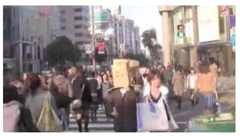
Figure 5 One group's experiment of wearing boxes in streets to examine people's exchange of gazes in the space