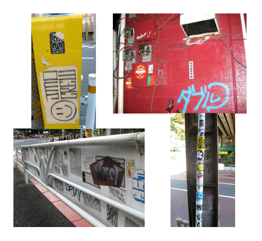
Figure 1 Graffiti's bri-collage on various surfaces in our city

As Tanizaki suggests, the artificial and historical enactment by the people transforms the senses and understandings of spatial phenomena. In this process, we can continue to uncover new ideas of creativity in the relation between the environment and the people. In our complicated and flattened urban circumstance, it is becoming difficult to understand the direct and clear meanings of the phenomena. However, we can command multiple dimensions of imaginative sensuous powers and communications in re-expressing our inquiries, interests and surprises in our everyday experience in the city to obtain clues to self-recognition. Returning finally to the initial problem related to the reading of the now flattened surfaces of our urban spaces, we can read only the enacted traces of people and the environment. At the time that Anthony Vidler's book Writing of the Walls (1989) was first published, a New Jersey TV program examining graffiti called Writing on the Wall was broadcast. Probably, reading the shadow on the surface of such "writing on the wall" will provide insights into the inevitable future of our cities based on the different idea of communication.<sup>7</sup>